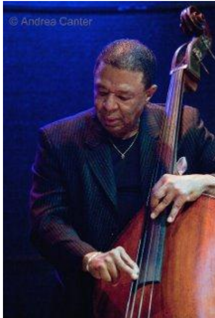
Buster Williams

Refocusing on acoustic music, Zeitlin turned again to solo piano work and other projects, including composing for Sesame Street; appearing on network TV (the Tonight Show and CBS Sunday Morning); touring throughout the world at colleges, clubs, and major festivals; and performing with such jazz luminaries as Joe Henderson, Herbie Hancock, Pat Metheny, Tony Williams, Marian McPartland, Charlie Haden, the Kronos Quartet, and Paul Winter.